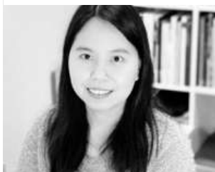
An PHAM Architect